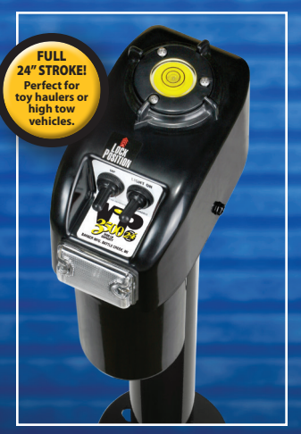
VIP 3500/24 - BLACK | P/N 32455