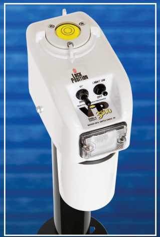
VIP 3500 - WHITE | P/N 30828