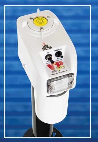
VIP 3000 - WHITE | P/N 30826