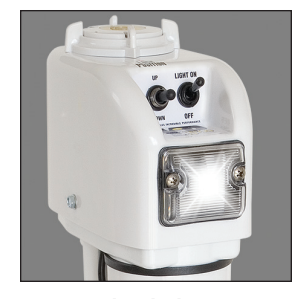
Nite-lite helps you hitch-up or unhitch.