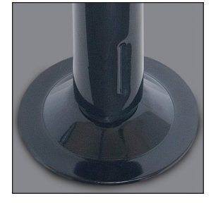
Attached Foot Pad.