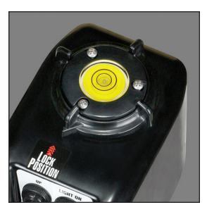
Patented built-in level right where you need it.