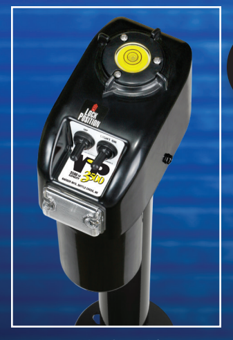
VIP 3500 - BLACK | P/N 32454