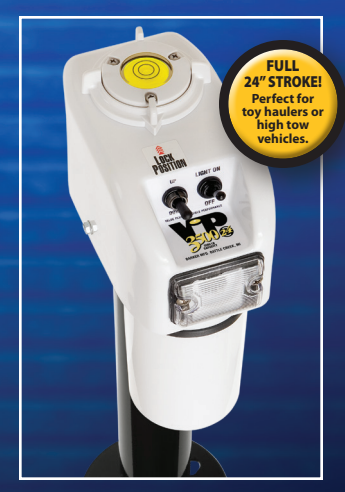
VIP 3500/24 - WHITE | P/N 31558