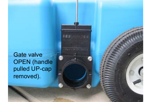
Gate valve OPEN (handle pulled UP-cap removed).