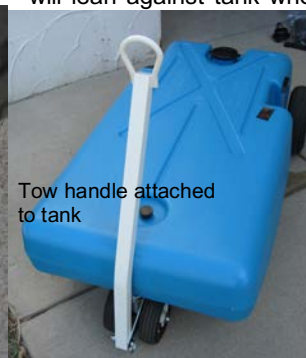
Tow handle attached to tank