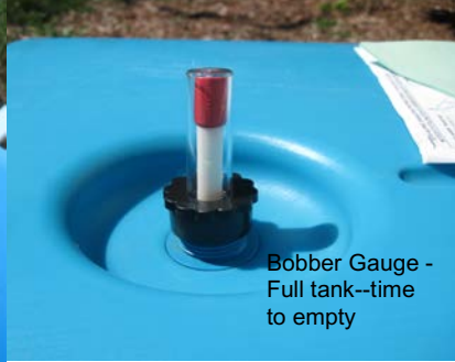
Bobber Gauge - Full tank--time to empty

Remove garden hose cap and install bobber gauge. Once tank is full (you can tell from the bobber gauge), it needs to be emptied. Remove the sewer hose from trailer waste valve and the tank (you don't want to tow the tank with the sewer hose attached). Attach the 3" cap to top of tank (where sewer hose was located). Now you can hook the tow handle to the hitch ball on whatever you have to drive around (car, golf cart, bike, etc.) Bring your sewer hose...you will use it at the dump site. (If you are done camping, bring your grey garden hose so you can rinse your tank.) At the dump site, attach one end of the sewer hose to the side of your tank and the other end to the dump station. Remove the garden hose cap or bobber gauge for ventilation. Open the valve on the side of the tank by pulling up on the black handle and contents of tank will empty.