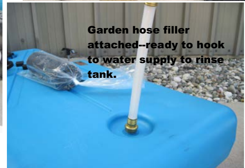
Garden hose filler attached--ready to hook to water supply to rinse tank.

Now you take the grey water hose and attach it where it was vented. You can hook up the water supply at the dump station and rinse your tank (if you are done camping). Put both 3" caps back on empty tank and take your accessories with you back to camp.