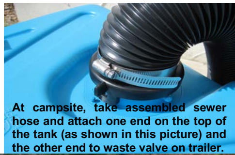
At campsite, take assembled sewer hose and attach one end on the top of the tank (as shown in this picture) and the other end to waste valve on trailer.