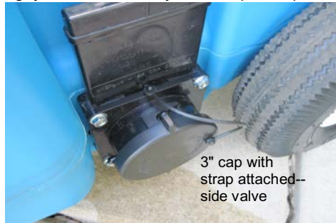
3" cap with strap attached--side valve

Step 5 - Attach one end of the rubber strap to 3" cap(s) and attach the other end of rubber strap to tank (one on side at valve and one on top). Close caps on tank for transporting. When you take the caps off to attach 3" adaptor/sewer hose assembly for emptying, you will still have your transport caps at hands reach.