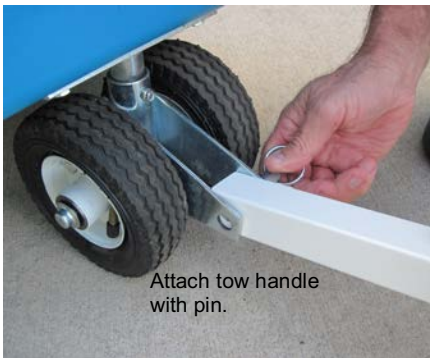
Attach tow handle with pin.

Step 3 - Attach tow handle (be sure the handle is turned the correct way--with the loop facing out or away from tank, so the handle will lean against tank when it is attached). Attach square black plastic cap to tow handle.