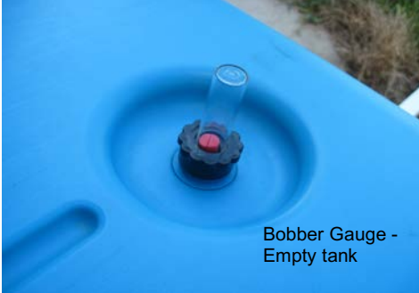
Bobber Gauge - Empty tank