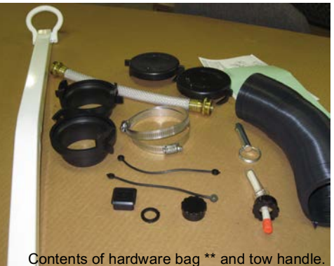
Contents of hardware bag ** and tow handle.

**Contents: Instructions, warranty card, tow handle, pin for handle, black square cap for handle, 1 grey filler hose, 1 bobber gauge, 2 bayonet hose adaptors, 2 hose clamps, 1 garden hose cap, 1 gasket for garden hose cap, 2 - 3" caps, 2 straps for caps, and 1 sewer hose.