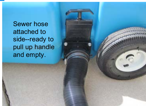
Sewer hose attached to side--ready to pull up handle and empty.

Remove garden hose cap and install bobber gauge. Once tank is full (you can tell from the bobber gauge), it needs to be emptied. Remove the sewer hose from trailer waste valve and the tank (you don't want to tow the tank with the sewer hose attached). Attach the 3" cap to top of tank (where sewer hose was located). Now you can hook the tow handle to the hitch ball on whatever you have to drive around (car, golf cart, bike, etc.) Bring your sewer hose...you will use it at the dump site. (If you are done camping, bring your grey garden hose so you can rinse your tank.) At the dump site, attach one end of the sewer hose to the side of your tank and the other end to the dump station. Remove the garden hose cap or bobber gauge for ventilation. Open the valve on the side of the tank by pulling up on the black handle and contents of tank will empty.