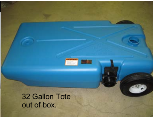
32 Gallon Tote out of box.