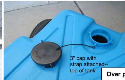
3" cap with strap attached--top of tank