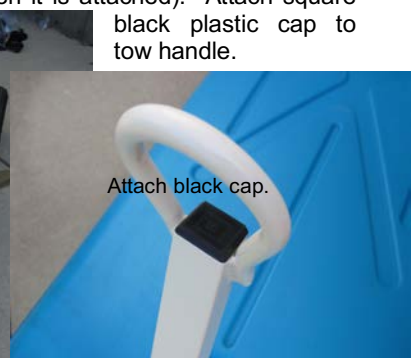
Attach black cap.

Step 4 - Put sewer hose onto adaptors and tighten with clamps. (This is the hardest thing hardest part of putting your tank together.) To make your life easier and less muttering under your breath, take a hair dryer, heat the hose slightly. The hose will expand to make the connection simpler. You can do it without a hairdryer, but you may break a nail and it takes some time and patience. Once you get one adaptor end on, put the two silver hose clamps onto hose and then attach the other adaptor. That way you won't have to unscrew the hose clamp to insert it around the hose. Now, tighten the hose clamp at the base of the adaptor and hose. (You can use a coin to tighten, if you don't have a screwdriver handy.)