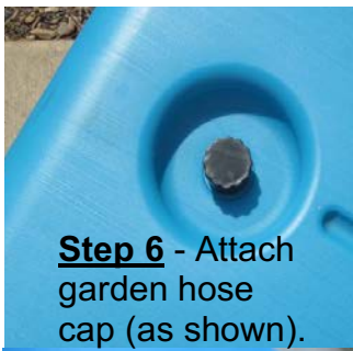
Step 6 - Attach garden hose cap (as shown).