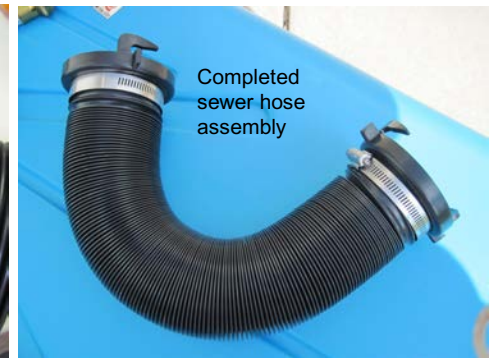
Completed sewer hose assembly

Step 5 - Attach one end of the rubber strap to 3" cap(s) and attach the other end of rubber strap to tank (one on side at valve and one on top). Close caps on tank for transporting. When you take the caps off to attach 3" adaptor/sewer hose assembly for emptying, you will still have your transport caps at hands reach.